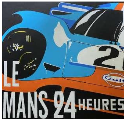
Porsche 917 - acrylic on canvas – 60x60 cm