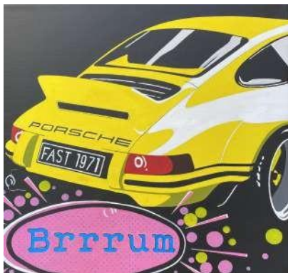
Porsche 911 - acrylic on canvas – 60x60 cm