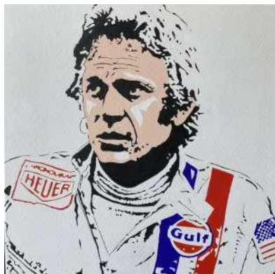
Steve McQueen - acrylic on canvas – 60x60 cm