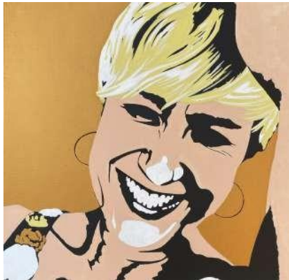
Laura - acrylic on canvas – 60x60 cm