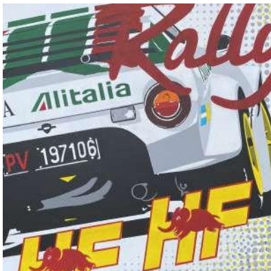
Stratos - acrylic on canvas – 60x60 cm