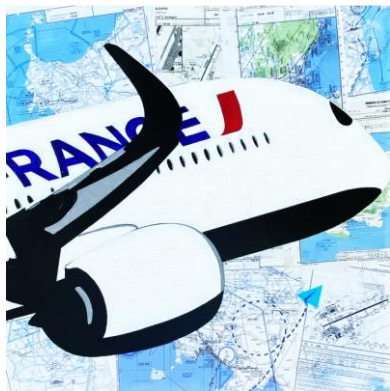
Air France - acrylic on canvas – 49x49 cm