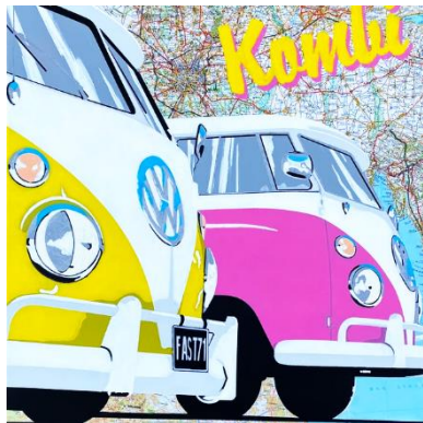
VW Kombi T1 - acrylic on canvas – 60x60 cm