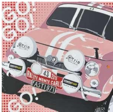
FIAT 500 - acrylic on canvas – 60x60 cm