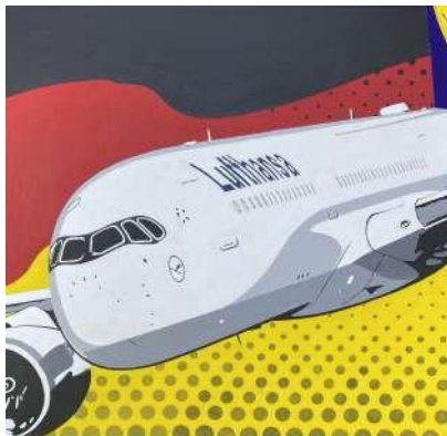
Lufthansa - acrylic on canvas – 60x60 cm