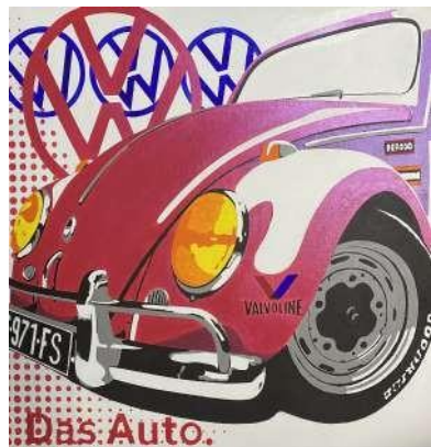
VW Bug - acrylic on canvas – 60x60 cm