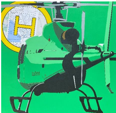
AS 350 B3 - acrylic on canvas – 60x60 cm